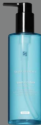
SkinCeuticals Simply Clean Cleanser $35