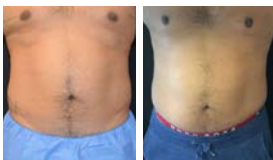
Before CoolSculpting After NicholsMD

CoolSculpting is our #1 non-invasive fat reduction procedure. CoolSculpting works by using controlled cooling to safely target and remove diet- and exercise-resistant fat.