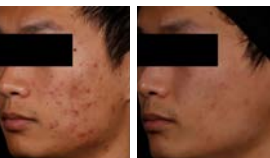
Before AviClear After AviClear

AviClear is the first FDA-approved laser device for the treatment of active acne. Engineered with innovative wavelength, this laser works to minimize acne at the source by selectively targeting and suppressing the sebaceous gland safely and effectively.