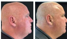
Before Laser After NicholsMD

Facial redness is a top complaint of our male clients. This 20-minute laser calms facial redness and tightens pores without any downtime.