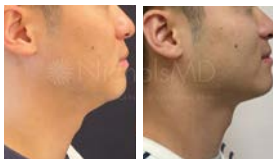
Before Kybella After NicholsMD

Kybella is an injectable treatment that helps the body to dissolve fat in the treated area. For men, the most popular treated area is the double-chin area.