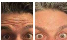
Before Botox® After NicholsMD

Nearly 7 million Botox procedures were done last year. With our conservative approach, you'll look well-rested without looking like you had work done.