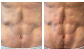
Before Emsculpt After NicholsMD

This is the world's only procedure that simultaneously builds muscle and breaks down fat. Emsculpt delivers results in the treatment area by metabolizing fat and building muscle.